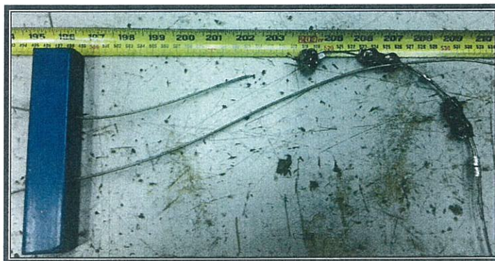
Photograph 2 : Shows tested sample