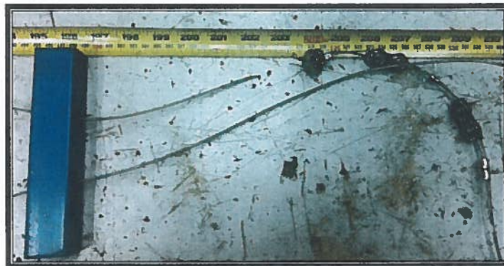
Photograph 2 : Shows tested sample