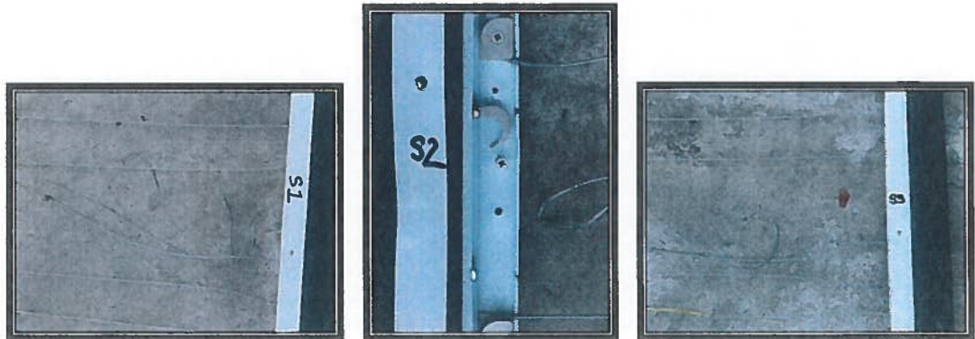
Photograph 2 : Show tested samples